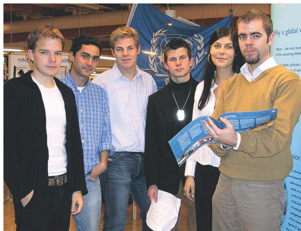
Students in Kalmar take an active interest in the work of the United Nations and GIWA. Here they are celebrating the UN Day October 24.

UN Day on October 24 was celebrated also in Kalmar, hometown of the GIWA headquarters. A GIWA exhibition was presented at the public library, along with local groups working for international organizations such as the Red Cross and Amnesty International.