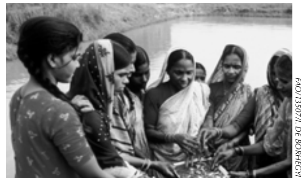
Solidarity, equity and cooperation are fundamental principles of bioethics