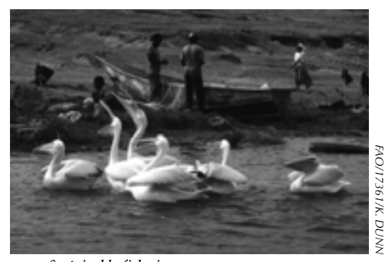
Sustainable fisheries must coexist with healthy ecosystems

The decline in fish stocks poses a disturbing, and potentially dangerous, threat to life in the ocean. Biodiversity is threatened by unsustainable fisheries and increasing pollution. Entire ecosystems may be degraded, and even destroyed, by human intervention. Depletion of fish stocks results in a decrease in food supply from the sea, economic loss, hardship to fishers and disruption of traditional ways of life. Overfishing thus threatens the ecosystem, the sustainable use of fishing grounds and the livelihood of fishing communities.