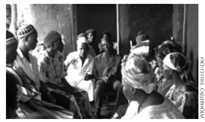
Quality information that is easily accessible and effective dialogue help ensure equity

central to the equity issue. The wide availability of quality information and effective dialogue are parts of the solution.