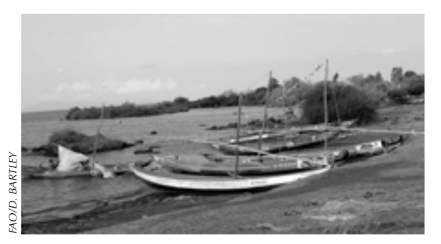
A major moral imperative in fisheries is to ensure resource conservation

A major moral imperative in fisheries is to avoid overexploitation and ensure resource conservation in a just and sustainable manner, enhancing people's well-being. The first part of this principle is generally accepted. Controversies abound, however, about the most effective way of achieving a balance between the imperatives