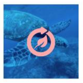
BYCATCH Conserving marine biodiversity