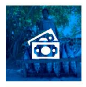
ECONOMICS Capturing employment & revenue benefits