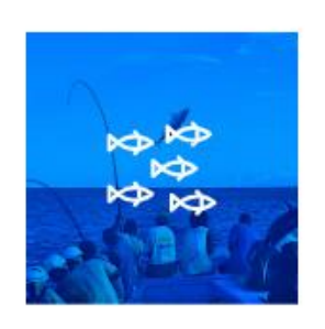
PACIFIC OCEANIC FISHERIES