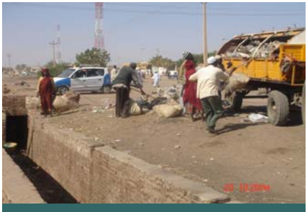
Cleaning drainage canal at Kosti