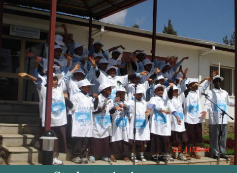
Students singing songs