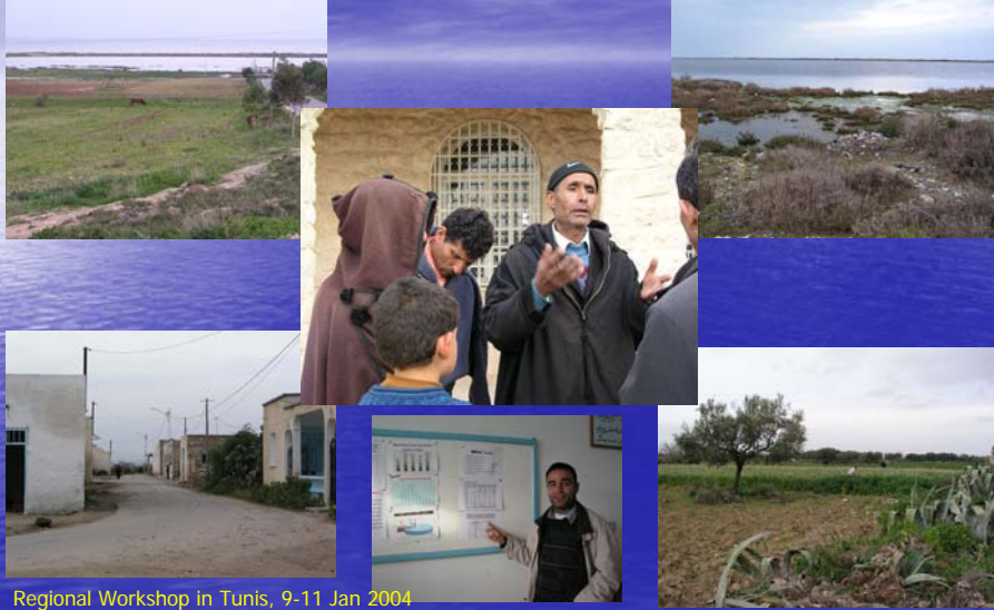
Regional Workshop in Tunis, 9-11 Jan 2004