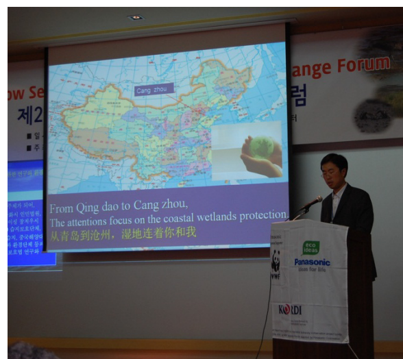
Presenting on the Yellow Sea conservation project

With the strong partnership between YSLME and WWF, became even more influential when Panasonic invested two phases of the project to conserve biodiversity in the Yellow Sea. The YSLME project organized the first GEF parliamentary conference to discuss the environmental program in the Yellow Sea, as the major management resolutions, e.g. harmonization of legislation, institutional reform and increasing budget, are within the responsibilities of the parliamentary organizations. The YSLME also focused on legislation harmonization, institutionalized reforming and increasing financial support. See the IW Experience note concerning the conference at http://www.iwlearn.net/experience . For more information on the project, please visit http://www.yslme.org .