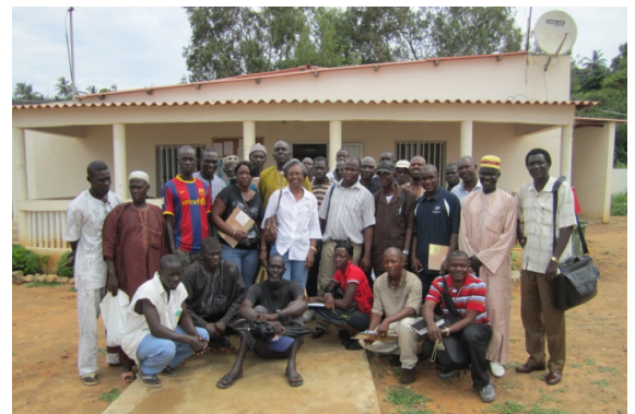
Executive members of the Co-Management Association of Robertsport, Liberia on a study tour in Senegal

As stated in the project proposal, "The local fishing communities should be empowered and where necessary organized (e.g. as legally recognized Local Fishers' Committees) to collaborate with government institutions to sustainably utilize and manage the globally-significant coastal fisheries resources." For more information, please visit http://www.worldbank.org/projects/P106063/west-africa-regional-fisheries-program?lang=en .