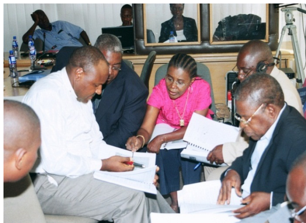
Bi-annual Ballast Water Treatment R&D Symposium

The Convention "stipulates that all ships should be equipped with ballast water management systems to meet the ballast water performance standards by the year 2016. This means that it is essential that the current technology hurdles are overcome and effective management solutions have been scale tested and installed."