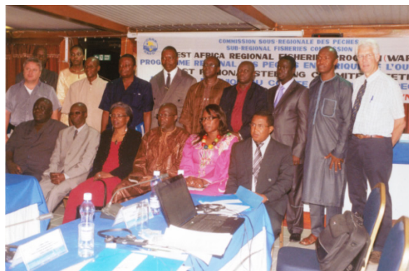
West Africa Regional Fisheries Steering Committee

The Local Fishers' Committees, government, GEF and World Bank collaborated to sustainably utilize and manage the coastal fisheries resources.