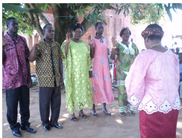
Newly selected executive members of the Co-Management Association (CMA) in Robertsport, Liberia taking oath during a community meeting