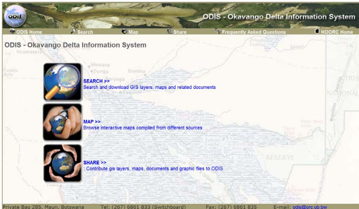
Figure 5. Okavango Delta Information System (Voyager GIS Technology)