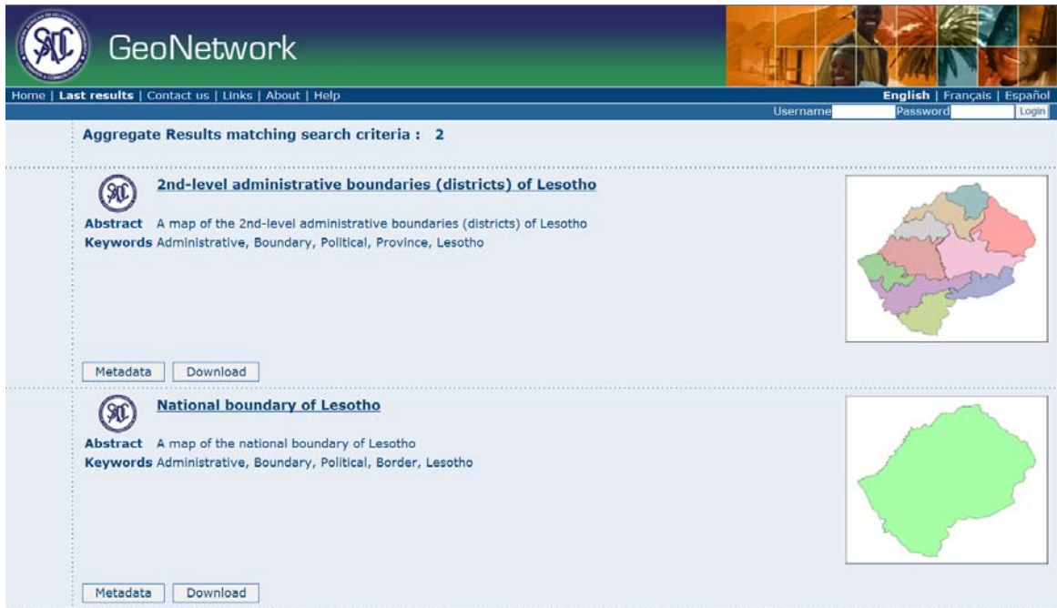
Figure 4. Example SADC Geonetwork search results for “Lesotho”