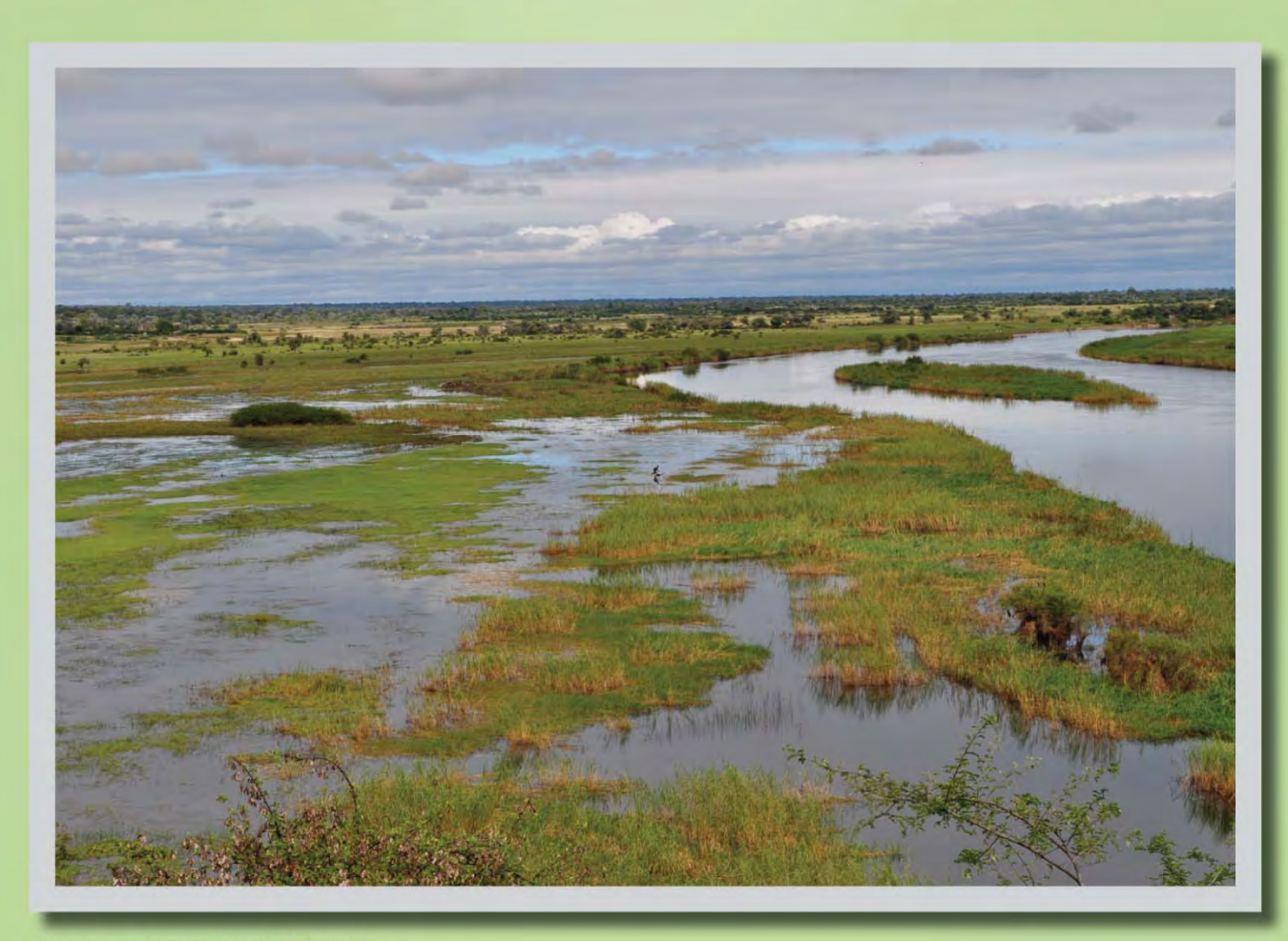
Kavango River at Rundu, Namibia