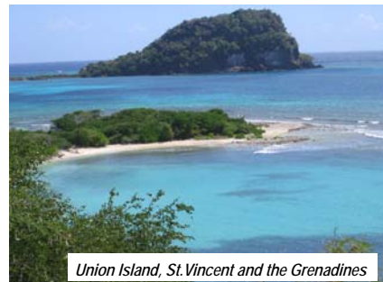
Union Island, St. Vincent and the Grenadines

Participants in the meetings also added the criteria "consideration of ongoing projects at the national level" to the list. Based on an analysis of