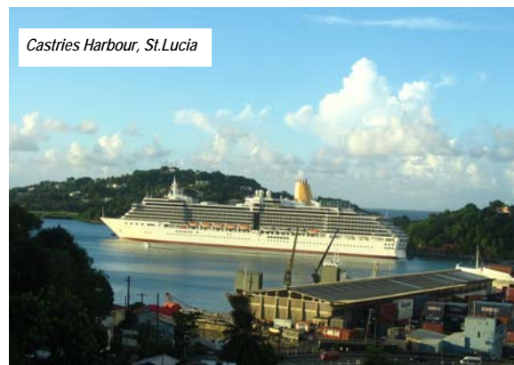
Castries Harbour, St. Lucia

An unsustainable sectoral approach to management of our wa-