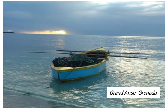
Grand Anse, Grenada

IWCAM should be recognized as a continuous, proactive and adaptive process of resource management for environmentally sustainable development. It requires long-term commitment of resources and political support as well as a shift in approach. The importance of capacity building and training, at both the formal and informal levels (including all stakeholders and user groups) is also recognized. The IWCAM Project seeks to provide a catalyst for the start of this process, both through replicable demonstration projects and regional activities.