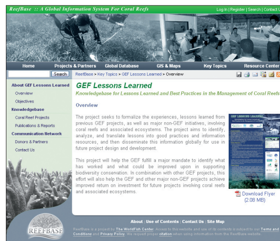
GEF Lessons Learned website