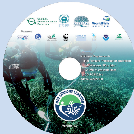
GEF Lessons Learned CD

We are very excited to be launching this CD and website and hope that you will find it useful. If you find information that is out-of-date or notice we are missing a critical piece, please feel free to contact us at reefbase@cgiar.org so that we can continue to provide the most current and useful information to coral reef managers.