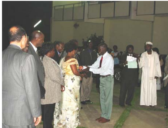
Ministers shake hands with winner before receiving the award

ticipation in environmental issues on the Nile, fostering cooperation and