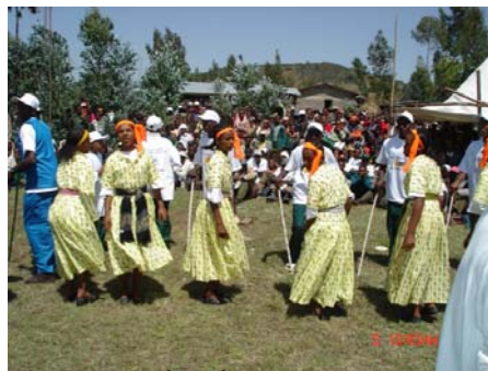
Awareness songs by students