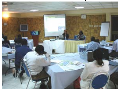
NRAK in Uganda

The national presentations generated a lot of excitement and participants were amazed with the wealth and the audio visual presentation of the information