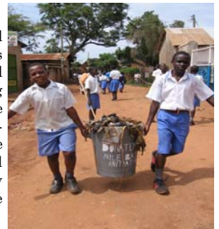
School Children collecting rubbish