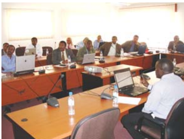
NRAK in Ethiopia

The national presentations generated a lot of excitement and participants were amazed with the wealth and the audio visual presentation of the information