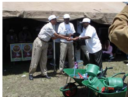
Award of tree nursery implements