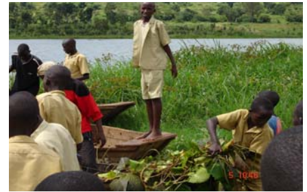
Children collecting water hyacinth

in addition to polythene tubes to establish a tree nursery. Awareness materials including T-shirts were distributed to schools. The event was jointly sponsored by MINITERE, Rwanda Environment Management Authority and