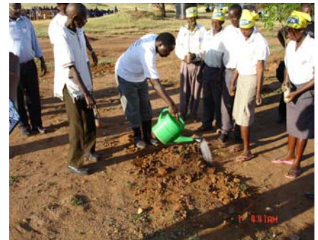
Guest of honour watering a seedling

the Nile Transboundary Environmental Action Project (NTEAP). UNDP Rwanda provided the school with 2 (two) 8m 3 capacity water storage tanks, gutters and