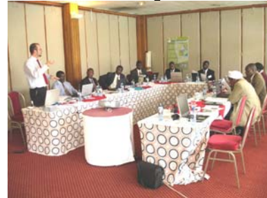
NRAK in Kenya

contained in the CD ROM. In Ethiopia the Steering Committee Member (PSC) sent a representative to participate, in Uganda the Environmental Management Institut