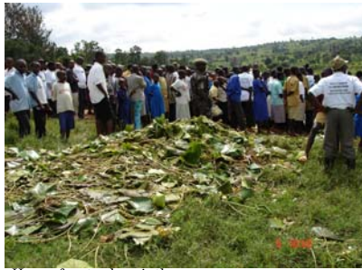
Heap of water hyacinth

In Nyagatare the guest of honour, Minister of Land, Environment, Forestry, Water and Mines (MINITERE) Hon. Christophe Bazivamu stressed the importance of appropriate farming practices and sustainable use of the natural resources for improved livelihoods and planted trees in Bihinga primary and secondary schools. SOPEM Rukomo secondary school in Nyagatare district was given