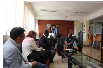
PMU meet Governor of Kisumu

The F&DMT project, with support from the Lake Victoria Basin Commission (LVBC) , held the 1st Project Steering Committee meeting in Kisumu, Kenya. Download the draft meeting report here .