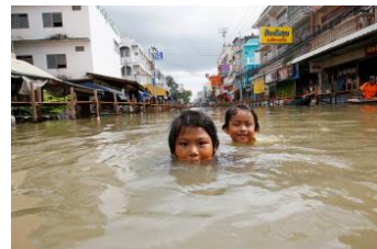
"Learning to live with water in the Chao Phraya"

During the inception phase, the PMU held consultations with key stakeholders in the Volta Basin, Lake Victoria Basin and the Chao Phraya Basin. Findings from the consultations were used to modify the project document guiding the work of the PMU. The Inception Report reflects these changes to the project document.