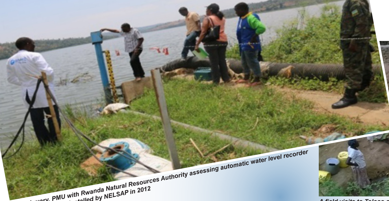
In February, PMU with Rwanda Natural Resources Authority assessing automatic water level recorder at Lake Cyohoha, installed by NELSAP in 2012