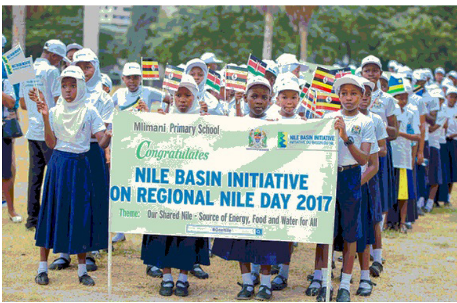
School children celebrating Nile Day in Dar es Salaam