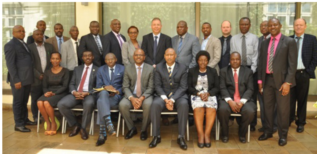
PS OF Energy ministries in Nile Equatorial, PTC Members from DRC, Burundi, Kenya, Rwanda and Uganda, AfDB, EU, Tractebel and NELSAP in a group photo