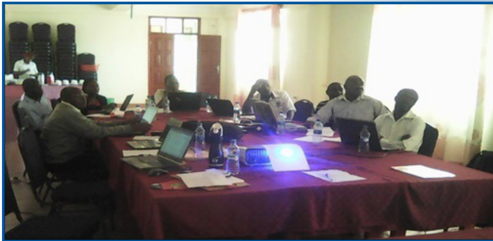
Hold hydro-met data refresher training for technicians (Uganda and Kenya) on data Quality Management System (QMS) (January 30, 2017 – February 03, 2017)