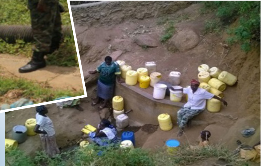
A field visits to Toloso sub catchment a water stressed area in Chee within the Middle Malakisi Sub Catchment with the on 26-27 January, 2017