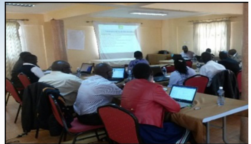
A stakeholder's workshop to review the draft inception report for preparation of the Middle Malakisi SCMP on February 23, 2017