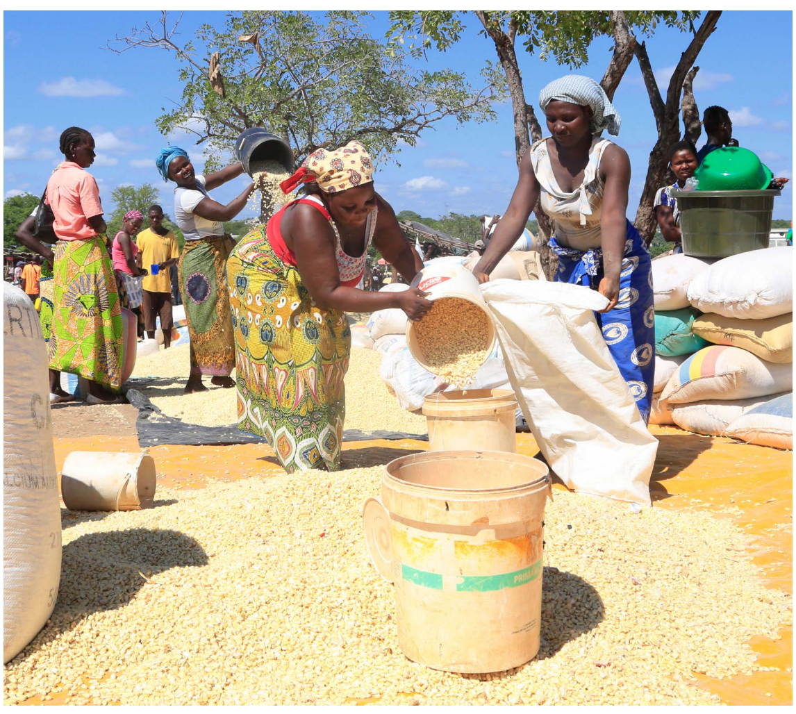
Women in Tete province, Mozambique

In transboundary settings, the socio-cultural practices and restrictive or prohibitive tenure and rights regimes described above limit opportunities for enhancing benefits through joint management across borders. Key stakeholders whose rights are constrained will be less represented in the fora that make decisions and identify the needs, benefits and costs of transboundary projects. Their voice and interests are effectively discounted, either as potential beneficiaries or as potential cost-bearers from alternative joint management options. Research is needed to better understand the links between tenure/resource rights and cooperation, e.g., whether more equal access to resource rights for women on both sides of a border drives more transboundary cooperation.