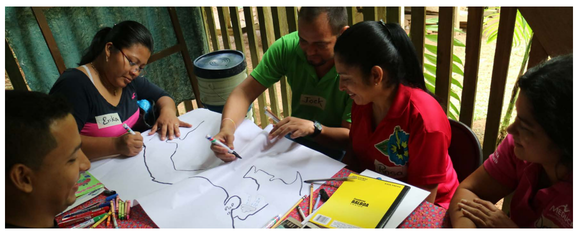
Environmental education workshop in Sixaola Basin

A review of voting patterns of representatives from the United States found female legislators demonstrating a stronger pro-environment voting record as compared to their male counterparts in (Fredriksson & Wang, 2011). It indicates that women's participation in decision-making at higher levels has specifically benefitted environmental policy, such that countries with more women in their parliaments are more likely to set aside protected land areas and ratify international environmental treaties (Pearl-Martinez et al., 2012). Research by UNDP has also revealed that there is a causal relationship between environment and gender equality: when gender inequality is high, forest depletion, air pollution and other measures of environmental degradation are also high (UNDP, 2011). Moreover, qualitative analyses show that women's involvement in the management of water resources and water infrastructure can improve efficiency and increase outputs (WWAP, 2016).