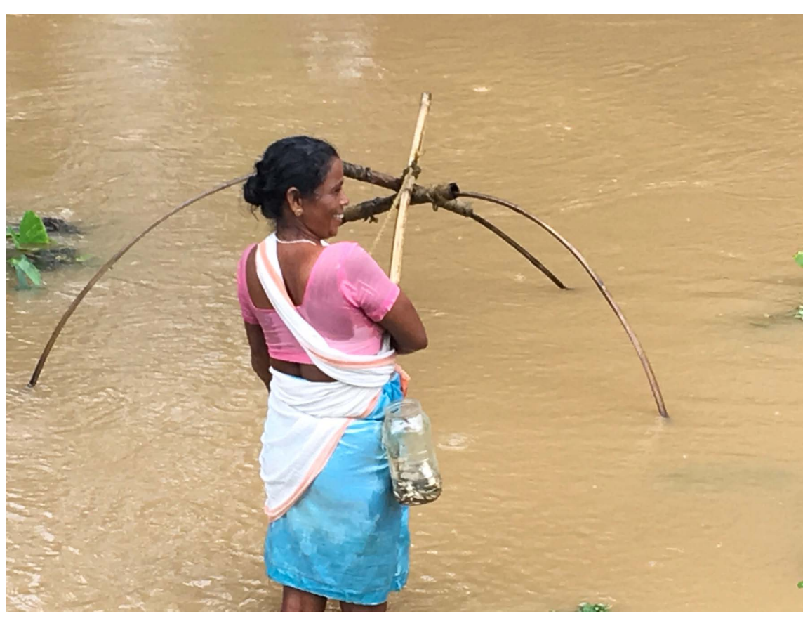
Woman fishing in the Brahmaputra river