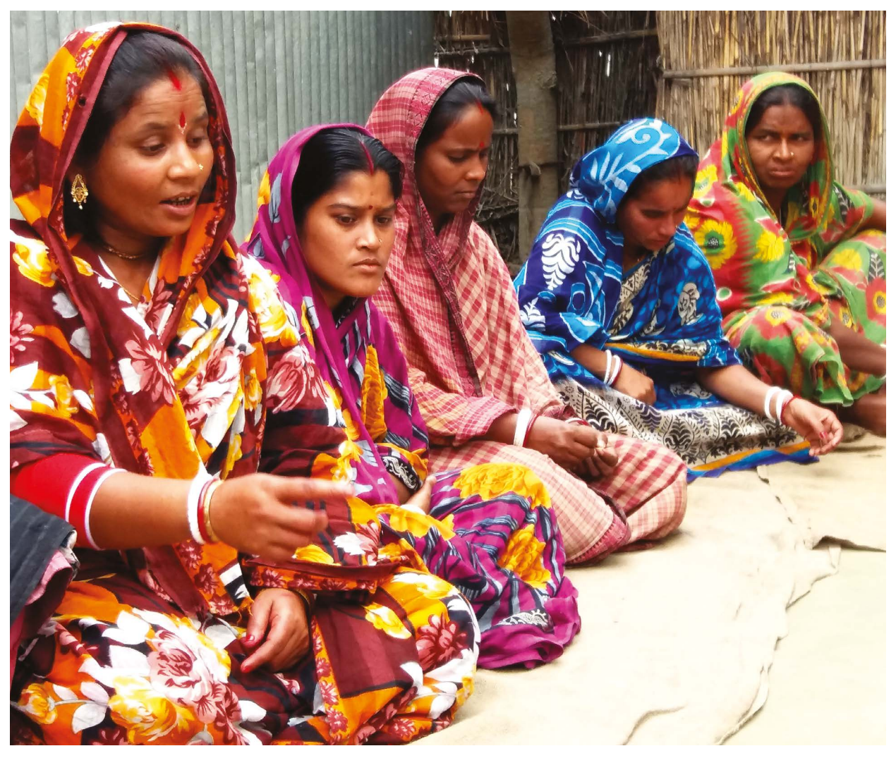
Chilmari FDG with women

Yet women have extensive knowledge about water resources and related ecosystems, as a result of their deep experience using and managing the resource for productive and domestic needs, as seen in the previous section. For example, women's knowledge about channelising the water from the river as a supplementary source during water shortage for agriculture was essential in Bhutan, along tributaries of Brahmaputra, where accessing this water in deep valleys represented notable challenges (Sen, 2018). Research shows that women's potential to support disaster mitigation and climate resilience planning, based on their knowledge about water for family and community, is vastly underutilised (Grant et al., 2016). "Traditional" knowledge that is passed along generations may be discounted against "modern" knowledge, and the example of Flora in the Bolivian Altiplano (Box 6) illustrates women taking a new handle on spreading that knowledge to help their communities build resilience to climate change. It shows the importance of valuing both types of knowledge and of supporting communities, including women, to treasure it and teach it to the next generations.