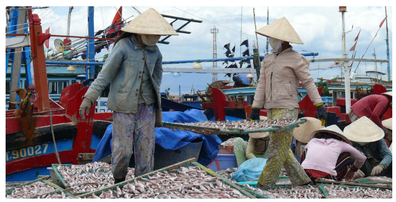
Women selling their fish catch in Vietnam