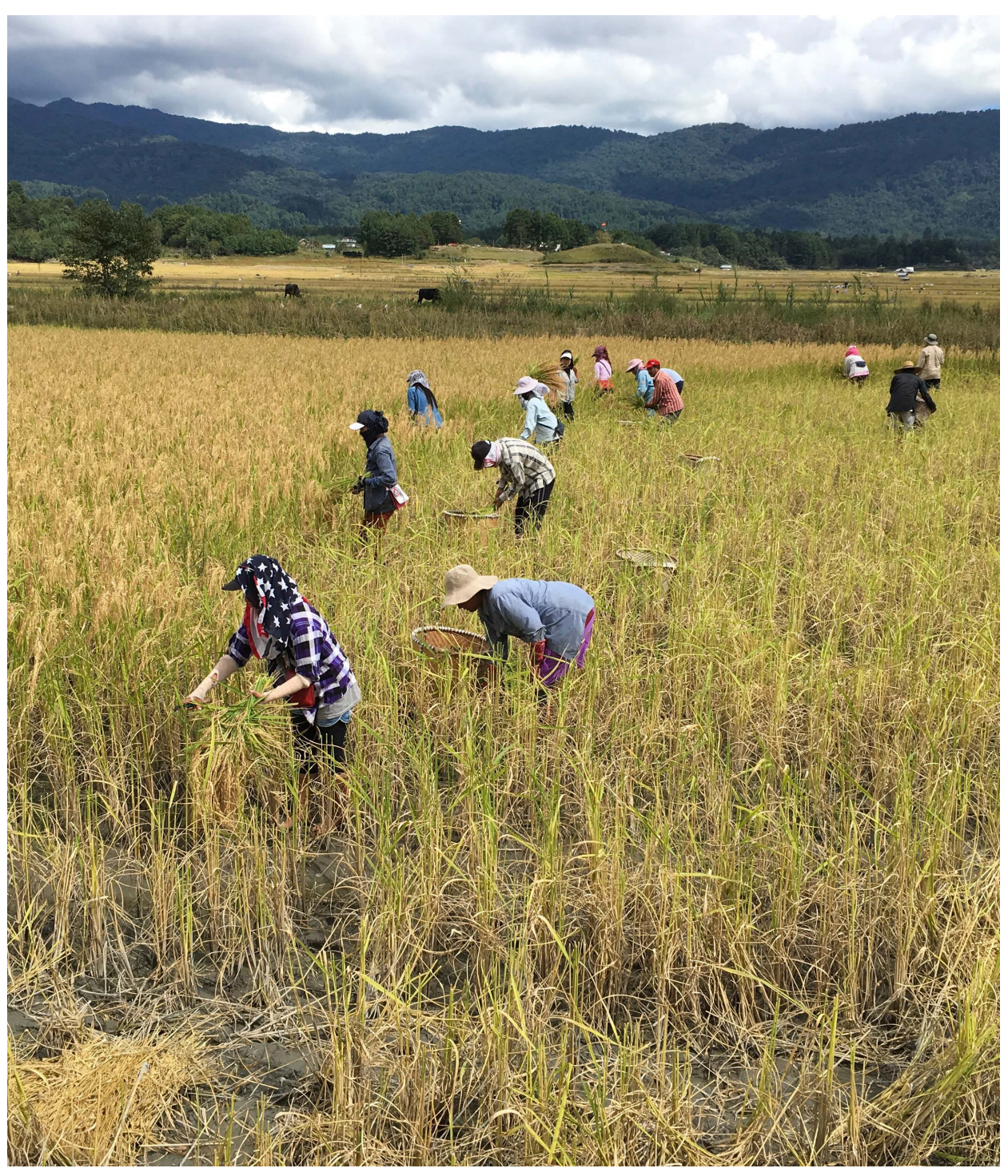
Predominance of women labourers harvesting labour intensive wet paddy in Ziro Valley, Arunachal Pradesh, India

[At ADED Valle] We support small enterprises providing capacity building on empowerment, business administration, access to credits and other business consulting. Throughout the process we always work to create awareness on good environmental practices and gender equity. We elaborated and obtained financing for a proposal to establish a binational development centre for local economic development, which considers the importance of environmentally friendly practices to protect the Goascorán and Nacaome basins.