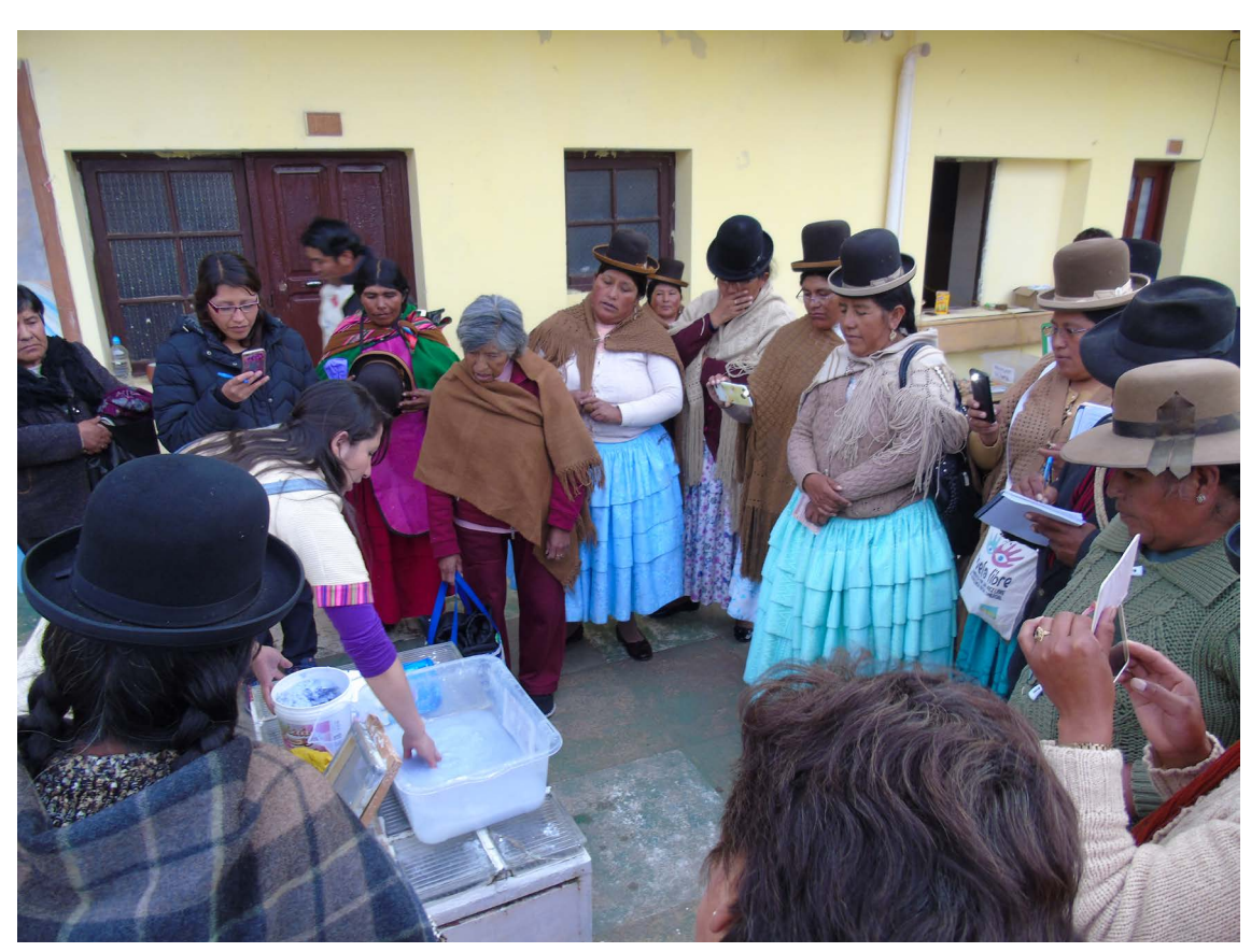
BRIDGE Champions workshop on water quality in the Lake Titicaca basin