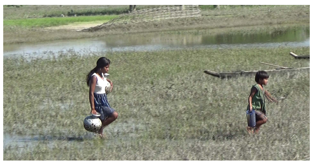
Girls collecting domestic water from flooded fields, Majuli Island in Brahmaputra River