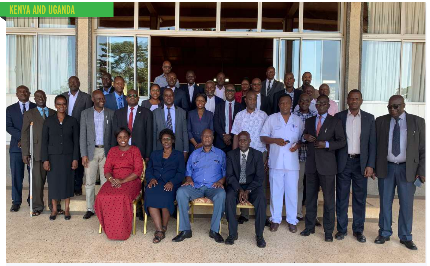
H.E THE GOVERNOR OF BUSIA, KENYA HON. SOSPETER OJAAMONG AND THE DIRECTOR OF WATER RESOURCES OF UGANDA MS FLORENCE ADONGO (FRONT SEATED) DURING THE LAUNCH OF THE ANGOLOLO WATER RESOURCES PROJECT