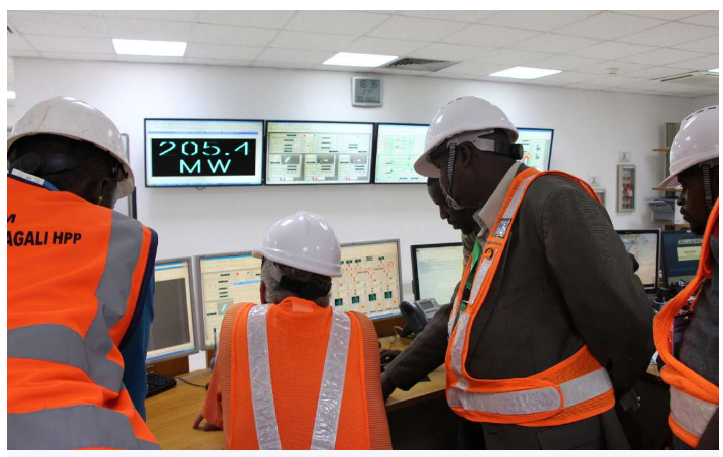
DAM SAFETY CAPACITY BUILDING TRAINEES FROM KENYA, UGANDA AND TANZANIA VISIT TO THE BUJAGALI POWER STATION IN JINJA, UGANDA