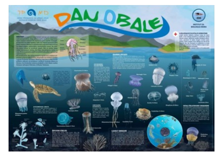
Leaflet "Jellyfish of the Mediterranean" (Montenegro)