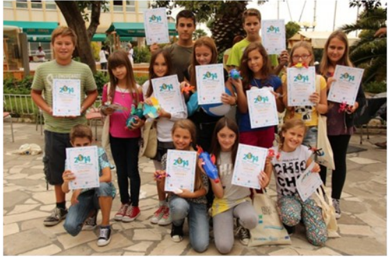
2014 Coast Day diploma for children participating to the activities in Šibenik, Croatia

A movie was prepared by PAP/RAC, under the Framework of the ClimVar & ICZM project. During the various celebrations, and via UNEP/MAP online networks, we projected and widely shared the short animated movie "A good climate for change". The movie was selected in two major film festivals: (i) Think forward Film Festival in Venise, Italy, for the best animated movie, and (ii) Animafest , in Croatia, where it competed in the category for the best commissioned movie.