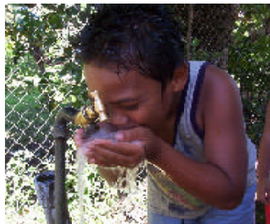
A boy drinks from an unfiltered water intake high in the Takuvaine Valley

The Kiribati community of Bikenibeu West has 205 households but only 64 have access to an adequate sewage or solid waste collection system. The IWP is assisting the community implement low-cost alternatives to manage their solid and liquid waste. Pictured above: Children making the most of a wrecked car in South Tarawa.