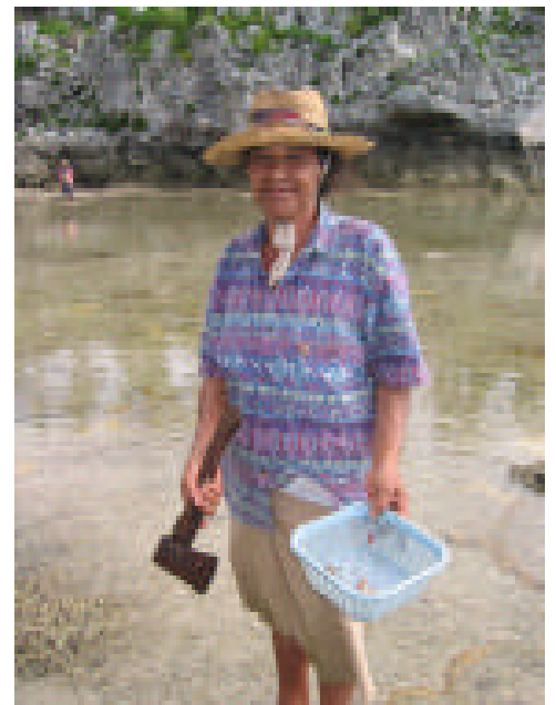
A Niuean gleaner uses an axe to collect tube worms from the reef.

The project is helping the communities of Alofi North and Makefu work together with the Government to improve the management of coastal fisheries. The Niue IWP is looking at a range of options such as strengthening existing marine protected areas.