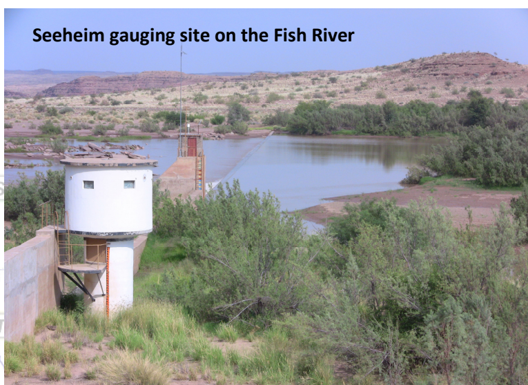
Seeheim gauging site on the Fish River