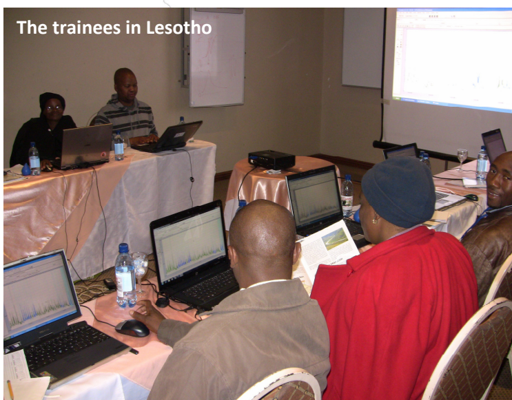
The trainees in Lesotho