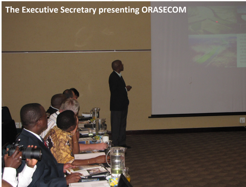
The Executive Secretary presenting ORASECOM