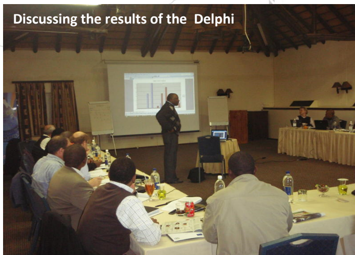
Discussing the results of the Delphi

Following on from decisions made at the October 2009 and April 2010 meetings of Council, the Secretariat, with support from the EU, will be undertaking a series of workshops aimed at providing clarity on a number of issues relating to the role ORASECOM should play in the Basin. This process will provide greater clarity on the contributions the Basin Wide Planning process and the Strategic Action Plan (SAP) and National Action Plans (NAPs) can make to realising regional and national developmental objectives.