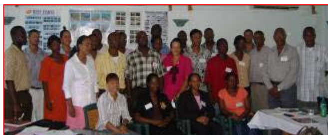
"People and Corals" Teacher Training Workshop participants

On completion of the workshop, each participating school received 25 copies of the workbook donated by the Sustainable Grenadines Project. The teachers agreed to use the workbook during the school term and were eager to share their knowledge with the other teachers. This workshop is only phase 2 of the Coral Conservation in the Grenadines Project which aims to promote and improve coral reef conservation in the Grenadine Islands by introducing coral reef conservation concepts and approaches at the primary school level. The evaluation of the use of the workbook is proposed to be conducted during December 2006/January 2007.