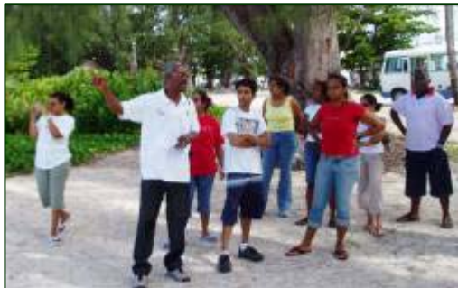
CERMES students on tour with Dr. Leonard Nurse

Our new students had the chance to meet CERMES staff as they participated in an adventurous environmental education land and sea tour of the island. On the tour, specific environmental concepts and issues discussed in courses are highlighted by the lecturers.