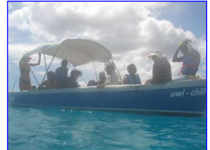
Onboard the 'UWI-Chill' and eager to get into the water

By the end of the week, all of the students were able to snorkel at the wrecks in Carlisle Bay marvelling at the wonders under the sea. Our students also learned how to make basic knots and splices, how to row a dinghy and also basic motor boat handling. They are all now more knowledgeable and prepared to work in and around the sea!