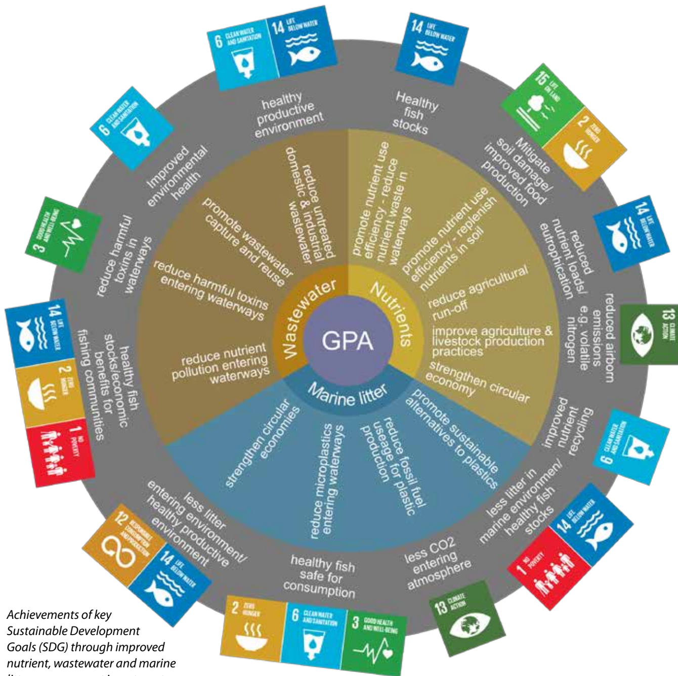
Achievements of key Sustainable Development Goals (SDG) through improved nutrient, wastewater and marine litter management investments