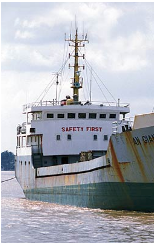
Lack of a coherent legal framework is a major obstacle to improved navigation development

The Mekong River Basin is about to undergo a rapid transformation in terms of economic development. Among the basic requirements for development are improved road, rail and air links. In the rush to improve these links, there is a danger that planners may neglect or overlook one of the oldest and most efficient forms of transport in the Mekong Basin - its rivers. For centuries, the people here have used the river as their highway. River transport is far less polluting, does not require appropriation of land, and has a broad range of socio-economic benefits including improved access for people in remote areas to schools, hospitals, markets and jobs. With all these benefits, why has river-based trade and transport fallen into decline in the last few decades? The answer: modern high-speed highways, railroads and air transport.