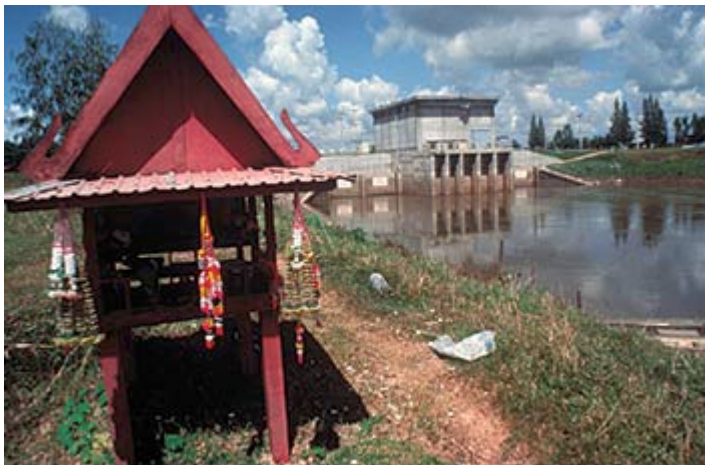
The Lower Mekong countries have now undertaken to notify each other on river-related projects that may have effects on their neighbors.

The Mekong has always played a central role in the lives of the people who live around it, as a source of food, water and transport. Now, in these opening years of the 21st century, the region is undergoing rapid change, and the way the river is used is changing as a result. Under increasing pressures, can this mighty river - the 8th largest in the world, ranking with the Amazon and the Congo for sustaining a vast diversity of plants and animals - continue to feed its people? When decisions about river development taken in one country affect the river's resources in another, how is its bounty to be shared?