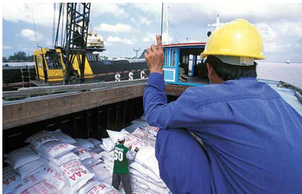
Freedom of navigation would create thousands of jobs