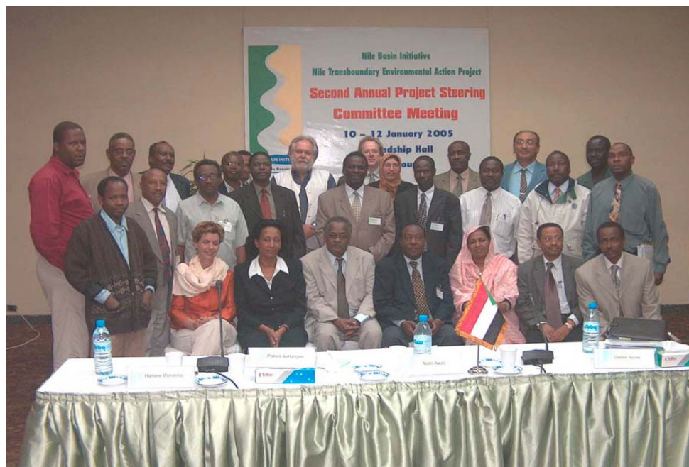
Participants of the Second Steering Committee Meeting, January 10-11 2005

The second Project Steering Committee (PSC) was held between January 10 and 11 2005 at the Friendship Hall, Khartoum, Sudan. It was attended by all members and observers except for Rwanda.