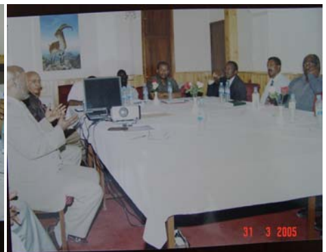
Participants of the EE&A national meeting and national action plan preparation meeting, Addis Abeba, Ethiopia