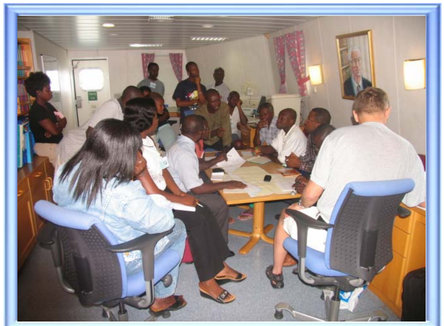
Group photograph of the scientific crew