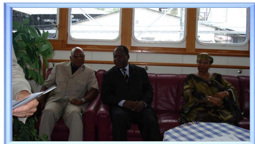
R-L: The FAO Representative, the Governor of the Littoral Province and an Inspector of MINEPIA.