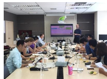
Flood and Drought Management Tools project at HAI