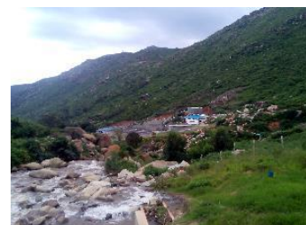
KIWASCO experience in the Water Safety Planning development and implementation, and the significance of the F&D DSS tool