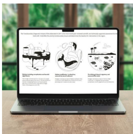
Figure 2 Showcasing illustrations from Gulf Mexico project