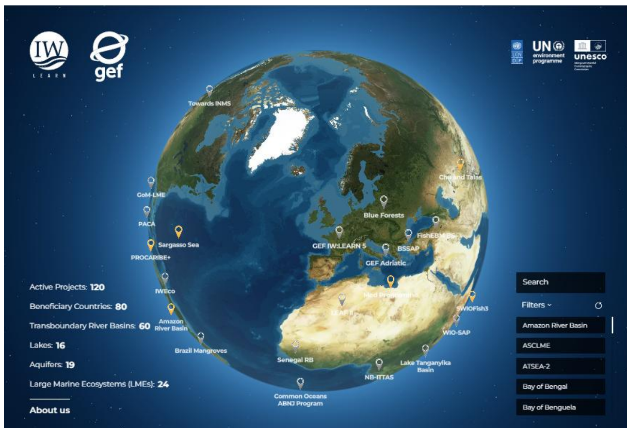
Figure 1 GEF IW:LEARN Story map

Additionally, it links the GEF International Waters (GEF IW) projects to global processes and frameworks , and key regional and basin-level partners, ensuring they remain connected to broader international efforts.