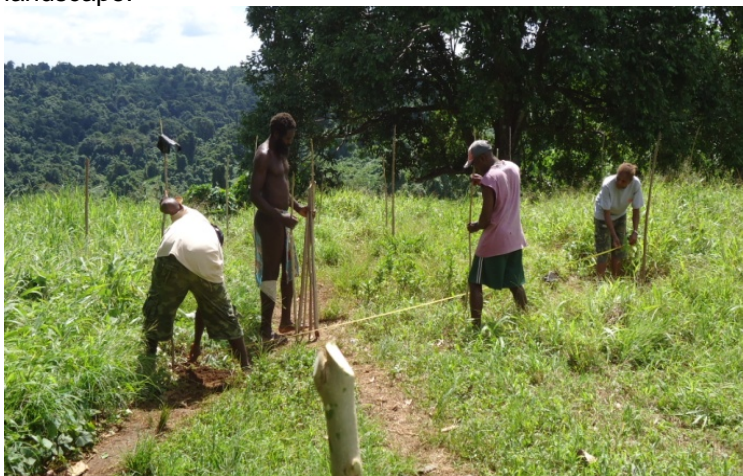
Pegging and mark spacing for planting

The demonstration site was identified and selected as per the nursery site but on a soil erosion landscape.