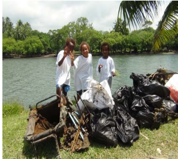
Figure. WWD 2012, school Children Collecting Rubbish along the Sarakata River & Kids as young as 7 are encouraged and posing with their collected garbage bags.

Mass Awareness Campaigns by the IWRM Steering Committee members in the communities within the catchment has proven successful with high numbers of community members attending to the awareness. Awareness was done to targeted members of the communities where individual meetings were held with women groups, with chiefs and elders of the communities. The next level to be reached is the National or Cabinet level.