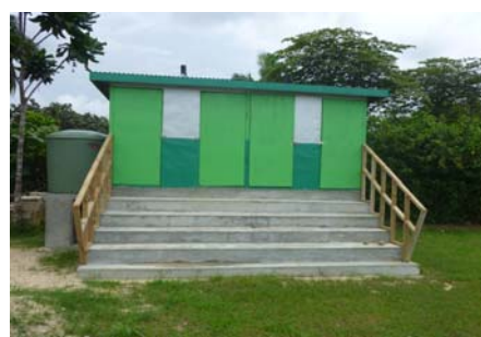
Figure. Women discussing location of their composting toilets and a composting toilet in Solway