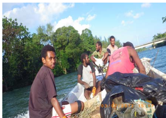
Fig. Vanuatu IWRM Focal Point with Youth Cleaning Up the Sarakata River & Youth collecting rubbish in the Sarakata River