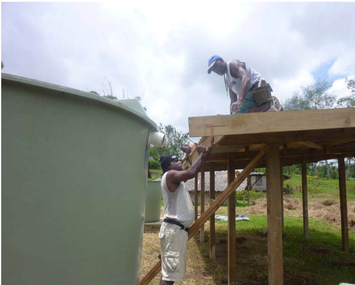
Figure. Construction of rainwater catchment at Butmas Community

The target of the project is to increase the percentage of the population that has access to safe drinking water. At the time of project start-up there was little if any work that concentrated at keeping the quality of water high. Routine monitoring of river water quality has been strengthened through the project to ensure safety baselines are met and to inform efforts to remediate pollutant source sites. In addition, increased outreach to areas that are more reliant on rainwater has allowed us to increase awareness of how to maintain rainwater catchment systems thereby providing a safe drinking water supply. The project has established a rainwater catchment system in one of the worst off areas to safe drinking water.