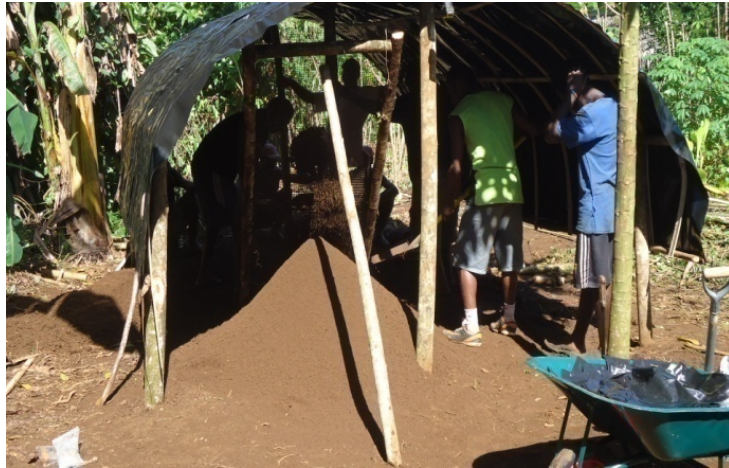
Figure. Potting Shed

The participants potted 1,102 planter bags and stacked the planter bags onto the Standout ground bed.