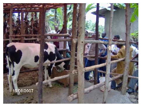
Integrated soil conservation in Rwanda: "Shrubs grown to restore degraded hill slopes used to feed cattle".

The Nile Transboundary Environmental Project (NTEAP) of the Nile basin initiative has launched the documentation of best practices in the micro grants and schools project activities.