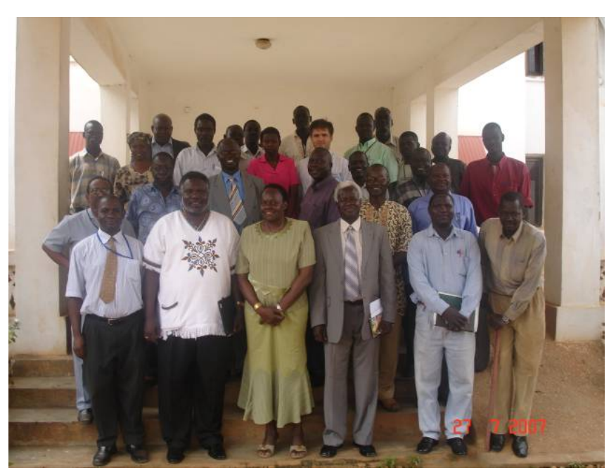
H.E State Minister for Environment (4th from right) with participants

Sudd Wetland Endowed with Unique Resources and Enormous Potential for Tourism- H.E State Minister of Environment of Sudan Says.