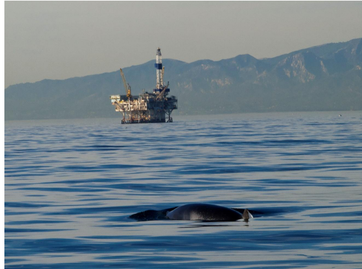
Whale and oil rig off California.