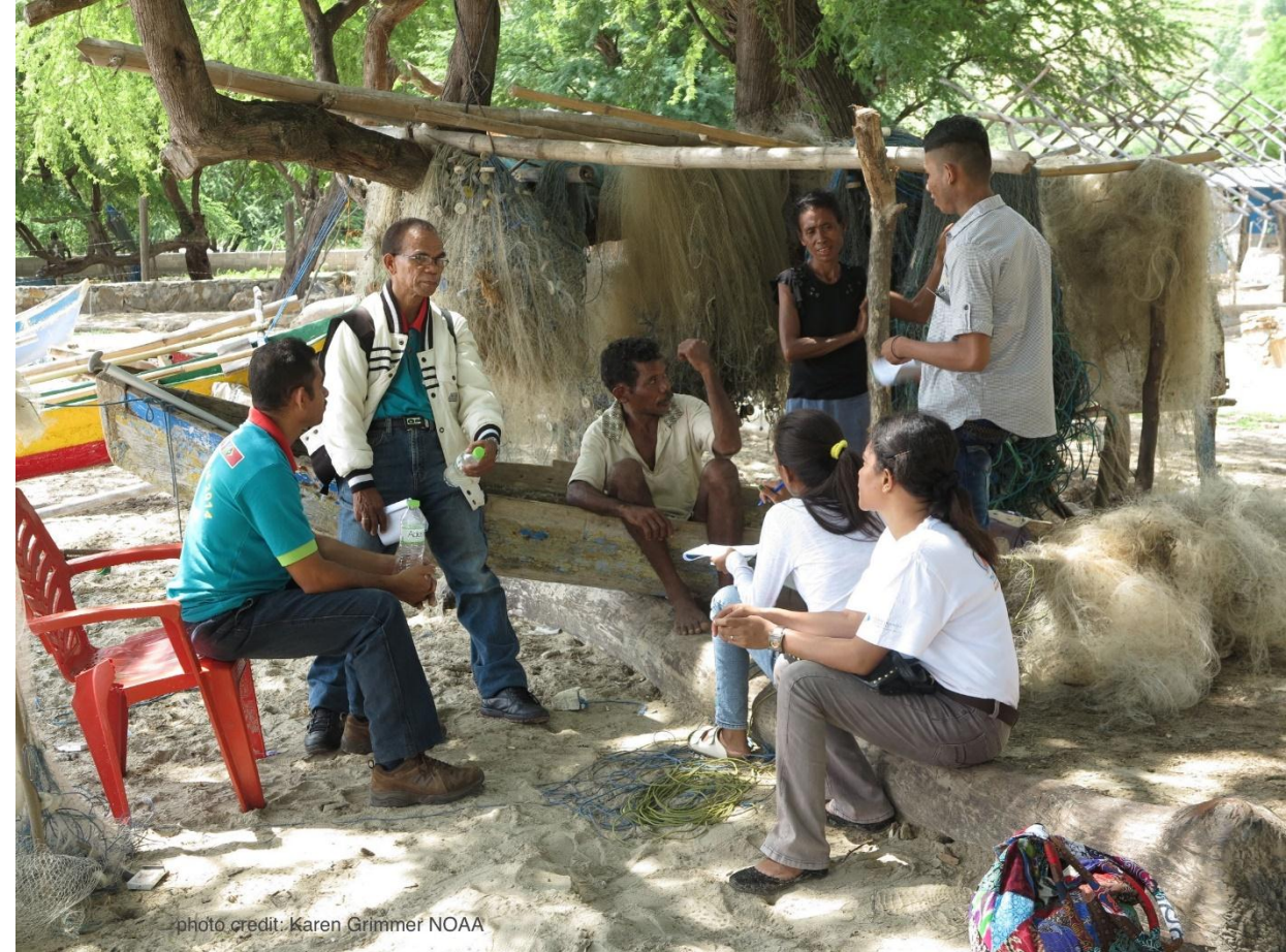
Discussing local MPA in Timor Leste.