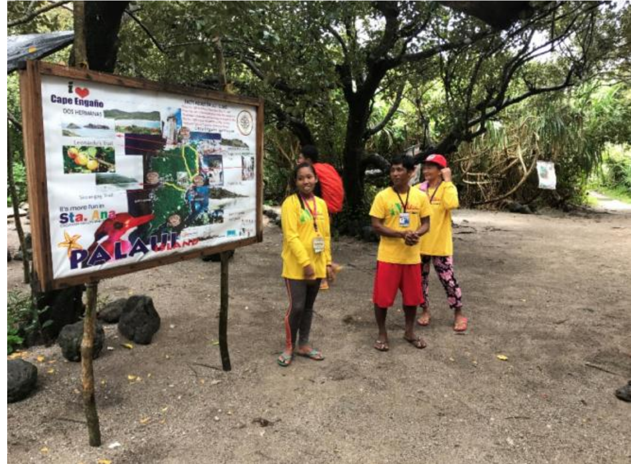
MPA Capacity Building training- Philippines.