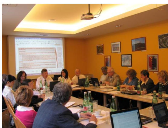
Experts meet to discuss on the ITRBM Plan (Ukraine, 2010)

Experts met every year two times to discuss the ITRBM Plan and to reach common agreement on the content and final conclusions of strategies. Experts were represented all the Tisza countries and the European Commission. In the frame of the project six Tisza Group meetings, six UNDP/GEF Tisza project workshops, two stakeholder conference and several public hearings, integration workshops and consultations were held and organized.