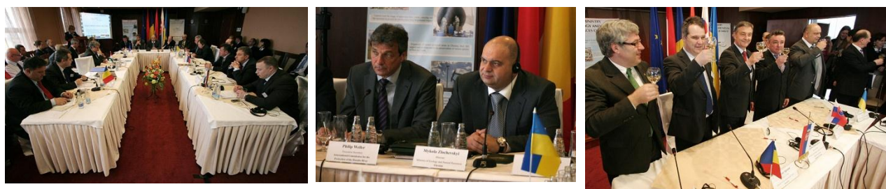
Pictures of the Tisza Ministerial Meeting (11 April 2011, Uzhgorod, Ukraine) – adoption of the Tisza Memorandum of Understanding to strengthen Tisza River Basin Cooperation

On 11 April 2011, in Uzhgorod, Ukraine the Tisza Ministers and High Representatives of the countries adopted the ITRBM Plan and updated the Memorandum of Understanding to express their commitment to the Integrated Tisza River Basin Management Plan and pledge to continue the efforts needed to achieve its goals.