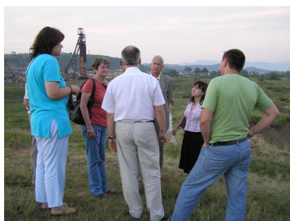
Discussion with Stakeholders (Ukraine-Slovakia Demonstration projects Integration Workshops (2010)