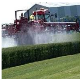
Hazardous Substance Pollution