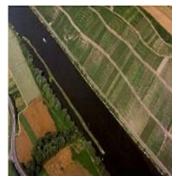
Pressure from river engineering works