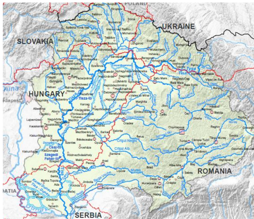
Tisza River Basin: Overview

The Tisza River Basin is the largest tributary of the Danube River and includes part of the territory of Ukraine, Slovak Republic, Hungary, Romania and Republic of Serbia. Over the last 150 years the basin has been subject to significant anthropogenic impacts that have resulted in a significantly degraded system, particularly in terms of pollution and the loss of floodplains and wetlands. The countries of the basin have requested support to develop an integrated strategy for water quality and water quantity that is incremental to the current work and to implement demonstration projects that test the multiple environmental benefits of wetlands to mitigate impacts of floods and droughts and help to reduce nutrient pollution.