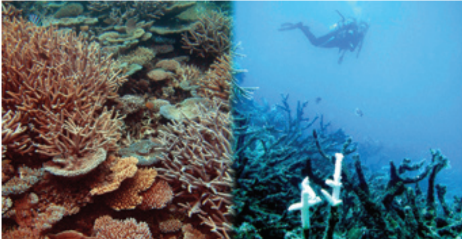
Figure 6 A healthy reef and one impacted by coral bleaching and crown-of-thorn outbreaks near human population centers on the Great Barrier Reef.

measure these risks and better understand local coral reef ecosystem responses to these risks. Through its capacity building and efforts to link science to management, it is translating these findings into an