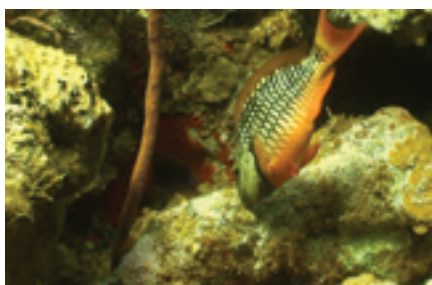
Figure 5 Parrot fish grazing on algae in the Caribbean.

Apart from protecting reef biodiversity in general and reef grazers in particular, maintaining good coastal water quality is equally important for sustaining healthy reef ecosystems, and something managers need to address urgently. Including tertiary treatment of waste water to remove phosphorous and nitrogen and treating industrial effluents to reduce high Biological Oxygen Demand (BOD) and toxic chemicals like Persistent Organic Pollutants (POPs) and heavy metals, are high priority investments for reefs adjacent to heavily populated areas or industry. In more rural settings, focusing on controlling non-point source pollution (including sediment) from agricultural run-off through