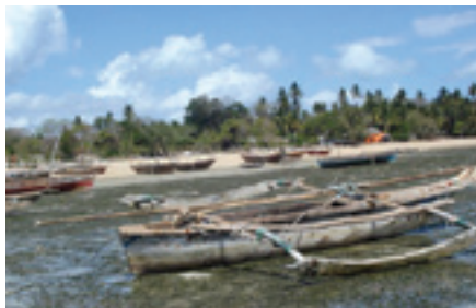
Figure 1 Fishing canoes on reefs in Zanzibar.

surrounding climate change and the urgent actions needed if the world's coral reefs are to survive in the second half of this century and beyond.