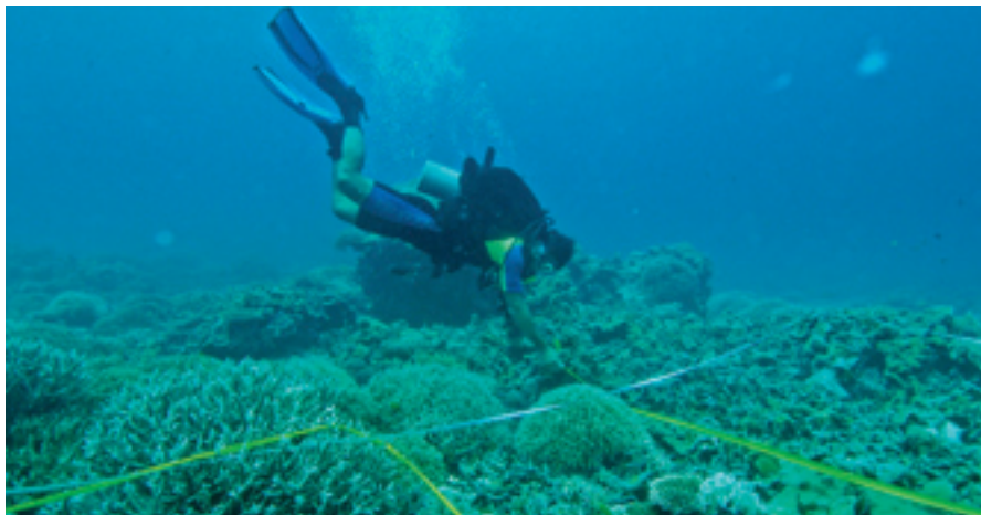
Figure 2 Mapping biodiversity on reefs in Palau.

What does this mean for coral reefs? Under conditions expected in the 21 st century, global warming will make coral bleaching more frequent—and potentially deadly, as corals have less time to recover between bleaching episodes. Ocean acidification from increased CO 2 dissolving into seawater will make it difficult, if not impossible, for coral reefs to continue to build the calcium carbonate skeletons which make them the only living structures visible from outer space. The 3-Dimensional structure of coral reefs provides essential living space to fish and the million or more species thought to inhabit them, making them one of the most productive and diverse ecosystems on earth. As a result of climate change, reef-building corals will become increasingly rare, leading to less diverse reef communities and ecosystem services that cannot be maintained.