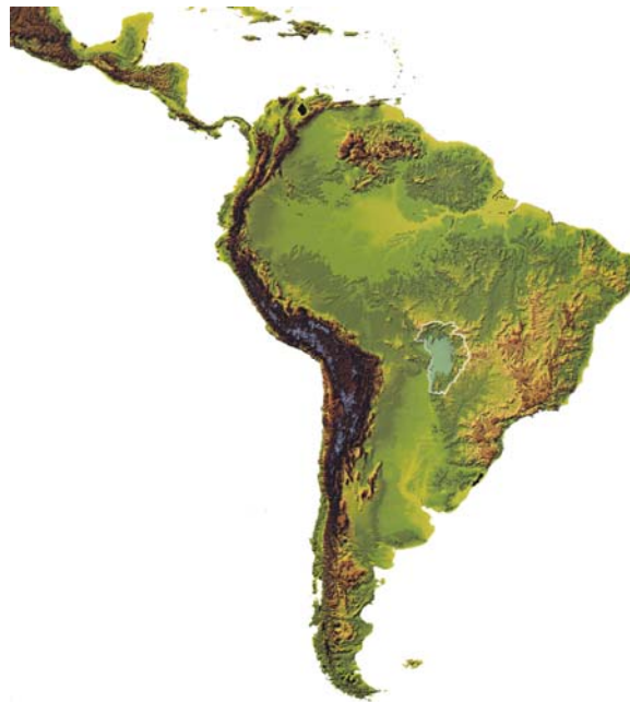
Figure 1 – The Pantanal Region

56. Surrounded by the Planalto , the Pantanal has been identified as a wetland of global significance by The Nature Conservancy and World Wildlife Fund. Major tributaries to the Upper Paraguay River are the Apa, Aquidauana, Cuiabá, Miranda, Negro, São Lourenço, and Taquari rivers, all of which discharge to the Pantanal.