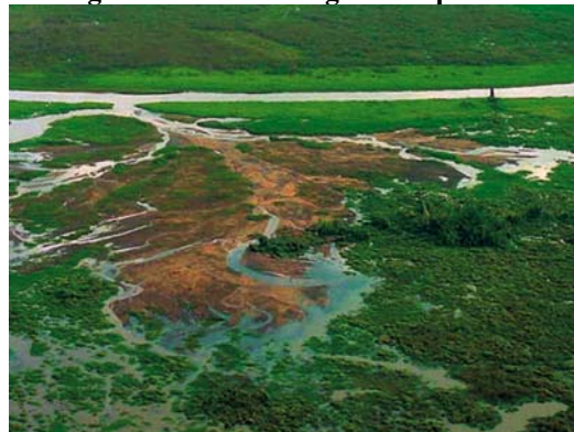
Figure 3 – “Breaching” in Taquari River