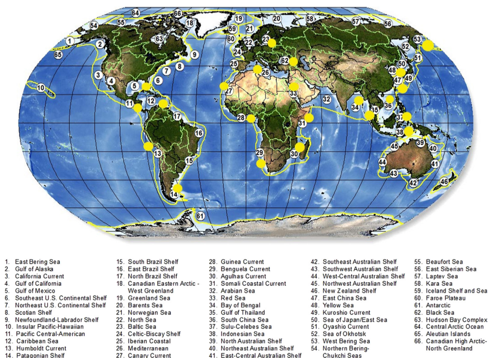
Fig. 1. Since 1994, projects in 22 LMEs, denoted by yellow dots, have received GEF, World Bank and donor country financing for supporting ecosystem-based management (EBM) of LME goods and services. (For interpretation of the references to color in this figure legend, the reader is referred to the web version of this article.)

In order to have an impact on these complex LME and linked coastal issues, GEF interventions have been made at six site-specific, spatially varying management scales: (1) global, (2) regional groupings of LMEs, (3) LMEs, (4) geographic sub-sets of an LME, (5) national sector, and (6) local cities, communities and site-specific ecosystems. By using a multi-scaled approach and progressive funding tied to progressive commitments to joint action through GEF supported processes, the achievement of a succession of milestones underpins GEF's IW Strategy. The goal is to catalyze joint commitments to